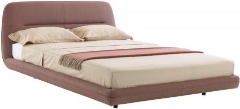
QUEEN SIZE 60" x 80"

DIMENSIONS H 36 " - W 65 " - L 90 " - SH 10 " -