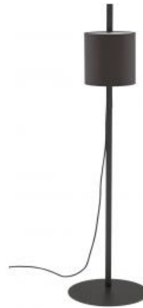
TABLE LAMP BLACK