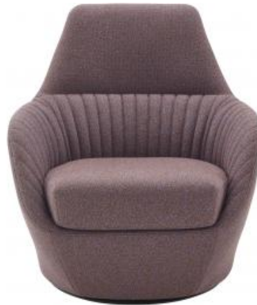
ARMCHAIR COMPLETE ITEM