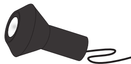
portable light black stained ash